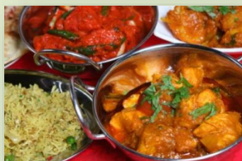
Eat Traditional Cuisine!