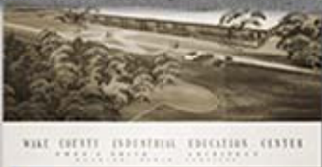
WAKE COUNTY INDUSTRIAL EDUCATION CENTER FROM A 1958 PUBLICATION

1958 - Wake Technical Community College was chartered April 3, 1958